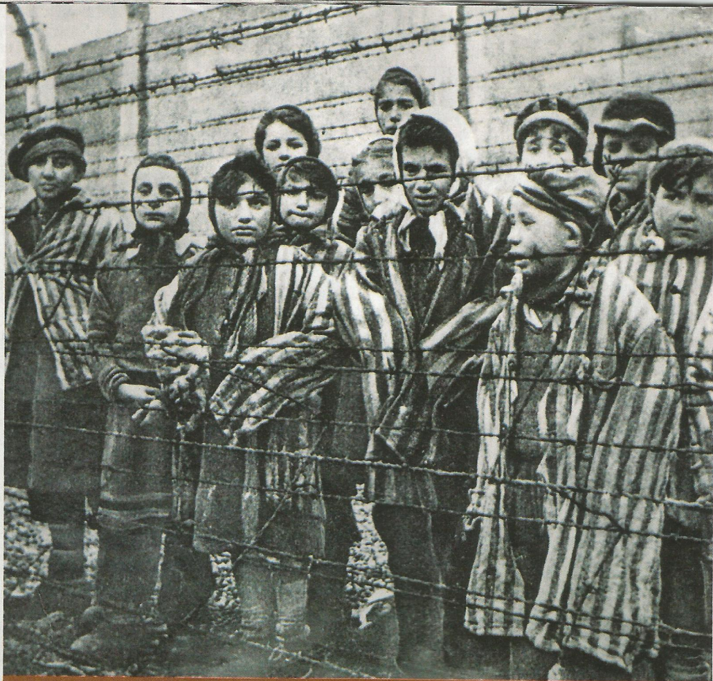
This 1945 photo shows children at Auschwitz, one of six death camps the Nazis built. Between 1933 and 1945, the Nazis murdered more than 6 million European Jews. Many were murdered in camps like this one. Catholics, Jehovah's Witnesses, Gypsies, gay people, and other groups the Nazis considered "inferior" were also murdered. This mass killing would later be called the Holocaust.