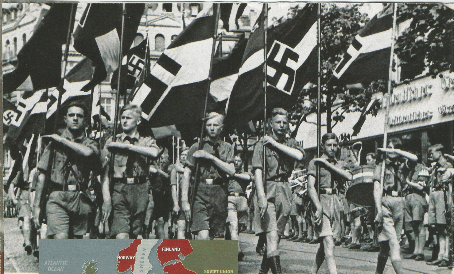
Above: The Hitler Youth march in a Nazi rally in Nuremberg, Germany, 1933. At the beginning of 1933, the Hitler Youth had 50,000 members. By 1936, membership had increased to 5.4 million. Left: This map shows Europe in 1942. What can you conclude about Nazi Germany?