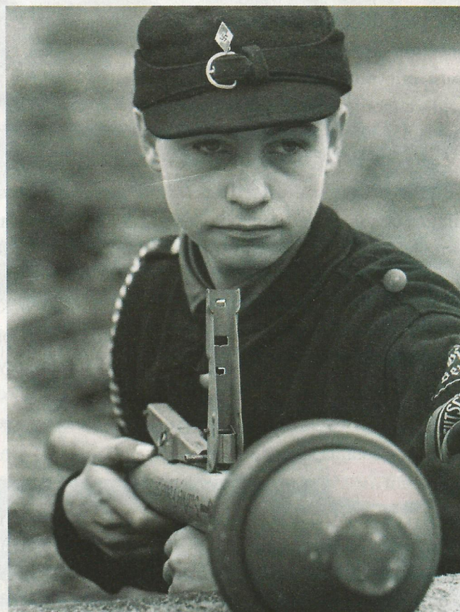
In the Hitler Youth, boys received military training and fought mock battles. They were being trained as future Nazi leaders.